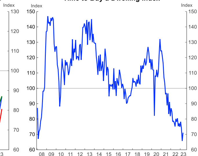
Time to Buy a Dwelling Index